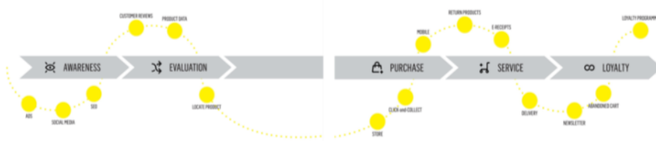
Figure 1. The customer journey, adapted from IMPACT (2020)